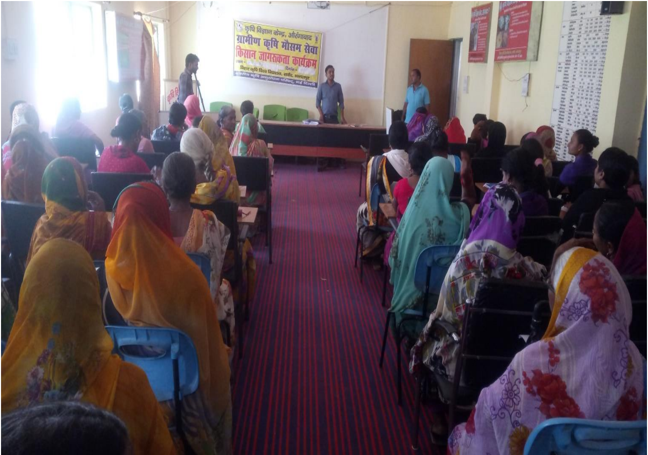
24. Good quality action photographs of overall achievements of KVK during the year (best 10)